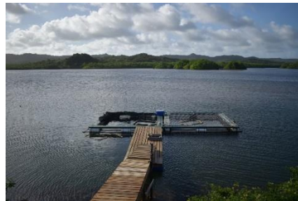
FIGURE 1. LEFT: PALAU ISLAND; RIGHT: PALAU AQUAFARM.