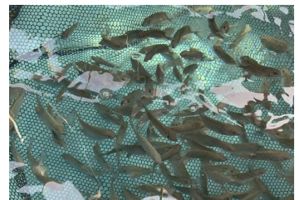
FIGURE 2. PALAU FISHNET.